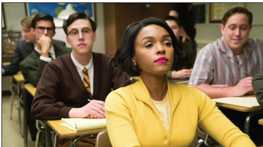
Janelle Monáe stars in a scene from the movie "Hidden Figures."